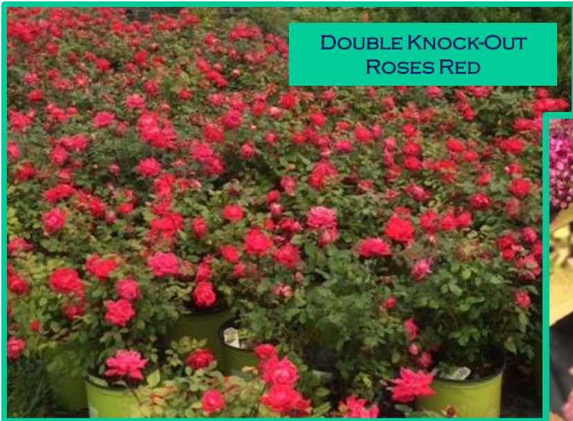
DOUBLE KNOCK-OUT ROSES RED