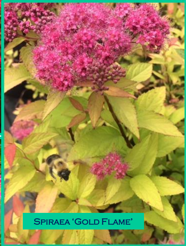
SPIRAEA 'GOLD FLAME'