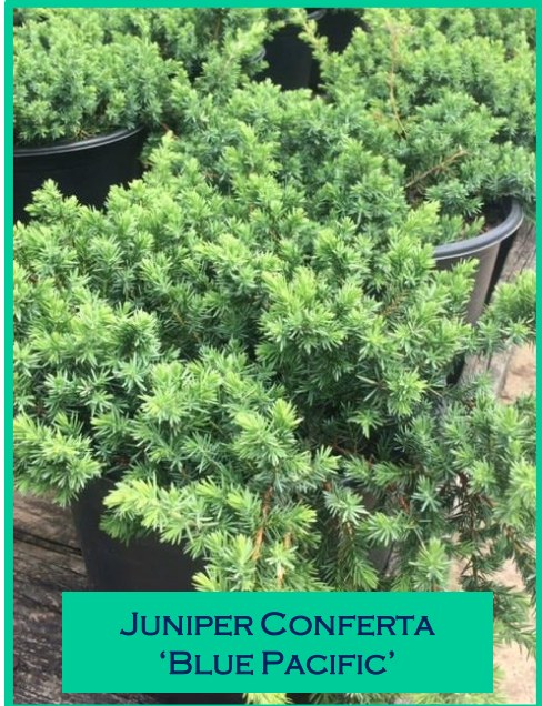
JUNIPER CONFERTA 'BLUE PACIFIC'